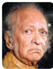
Pt Ravi Shankar: Booked first class airline tickets for his sitar so it could travel in comfort

who play these instruments are quite attached to their instruments. They apply sandalwood paste or vermilion on them.